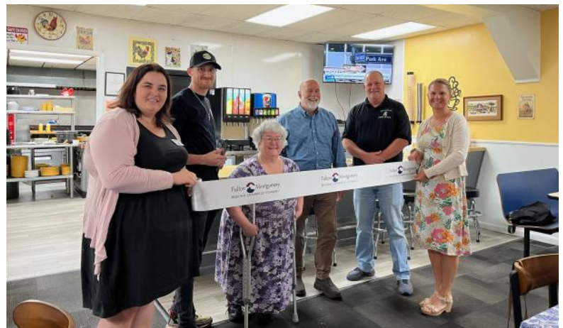
Photo above: 5S Diner, located at 12 Hancock Street, Fort Plain, celebrated its Chamber membership and new renovations, including a new outdoor porch for dining, with a ribbon-cutting ceremony that included staff, Chamber reps and elected officials. 5S Diner serves classic country dishes, made from scratch, focusing on locally-grown foods. Join them for breakfast, lunch, dinner and desserts. Check out their daily specials on Facebook .

Motor Sports adjacent to Adirondack Harley-Davidson, 106 Bellen Road in Broadalbin. There was a special flag dedication by the Combat Vets Motorcycle Association, live music, food and beverages, raffles and in-store specials. Stop in and check out their new space, gear and rides or check them out on Facebook .