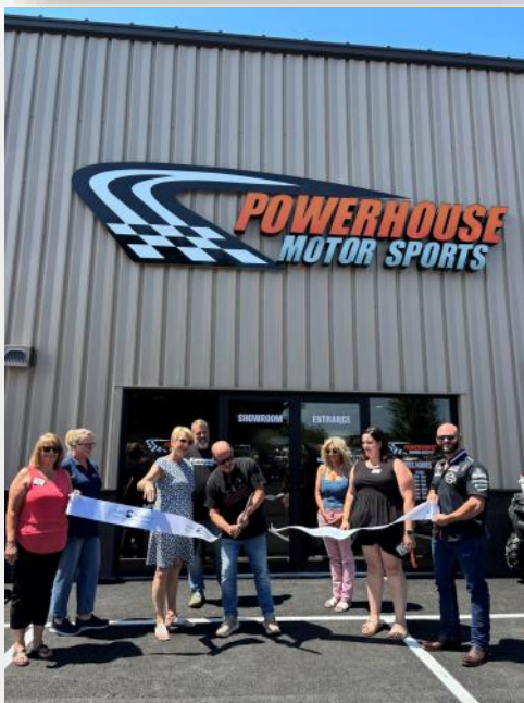
Photo at left: On July 19, the Chamber held a ribbon-cutting at the new location of Powerhouse

Motor Sports adjacent to Adirondack Harley-Davidson, 106 Bellen Road in Broadalbin. There was a special flag dedication by the Combat Vets Motorcycle Association, live music, food and beverages, raffles and in-store specials. Stop in and check out their new space, gear and rides or check them out on Facebook .