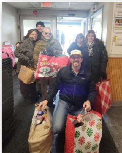
Members of the WMDC #6096 team deliver gifts to The Family Counseling Center for their Christmas Angel program.

The Family Counseling Center is so grateful to Walmart DC #6096 and every employee who has chosen to be an Angel over the years. Your generosity has made the holidays brighter for hundreds of children and reminded the families supported by the agency that this community truly cares.