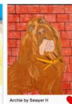
Archie by Sawyer H

Shelter dog PAWtraits created by student artists are for sale! Email: PR@fcrspca.org to reserve your favorite today, for $40!