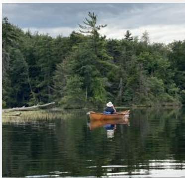
Randy Fredlund shooting photos from canoe.

The featured artist is Randy Fredlund. Randy's exhibit, "Our Place and Neighbors" , contains a collection of images captured over multiple years. Most have been shot in Fulton County during paddling or hiking excursions, or even around the house. The few that are taken in other locations are pictures of cousins of "neighbors" who reside nearby. Randy notes that no photo is worth anything until it is shared. This is particularly true of wildlife and nature photography. The opportunity to experience nature "up close and personal" is far too limited for most people, so striving to share with others that which they would not normally encounter is the goal. While nature photography can be limited by equipment and photographic technique, it is more often defined by opportunity. It matters not if you are a great photographer if you are never in the right places to point your camera at the eagle when he flies over. We hope you enjoy the images and share the excitement he felt when in the fortunate circumstance to capture them.