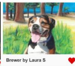
Brewer