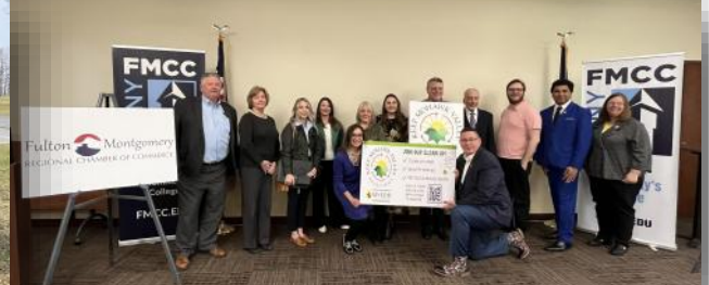
Above: The Chamber, along with its board members and representatives from Fulton and Montgomery Counties participate in Keep Mohawk Valley Beautiful's press conference about clean up efforts around the region.