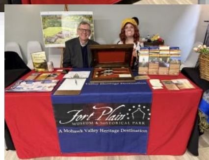
Scenes from the successful Business Expo at Amsterdam Muni held on April 2. Clockwise from top: Gateway Solutions ; A+ Plus Mowing & Trimming , and the Fort Plain Museum & Historical Park .