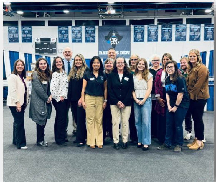
Above: The collaborating teams from the Chamber, SUNY FM, and FMS Workforce Solutions pose before the successful event.

We are proud to continue building these connections through our Business Education Partnership and look forward to creating even more opportunities that support a strong, prepared, and thriving workforce.