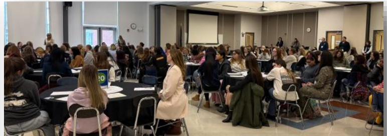
Above: The Business Education Partnership collaborated with HFM BOCES Career & Technical Education to present Women in the Workforce event on March 12. Women in non-traditional roles conversed with close to 150 students to talk about careers for women in our region.