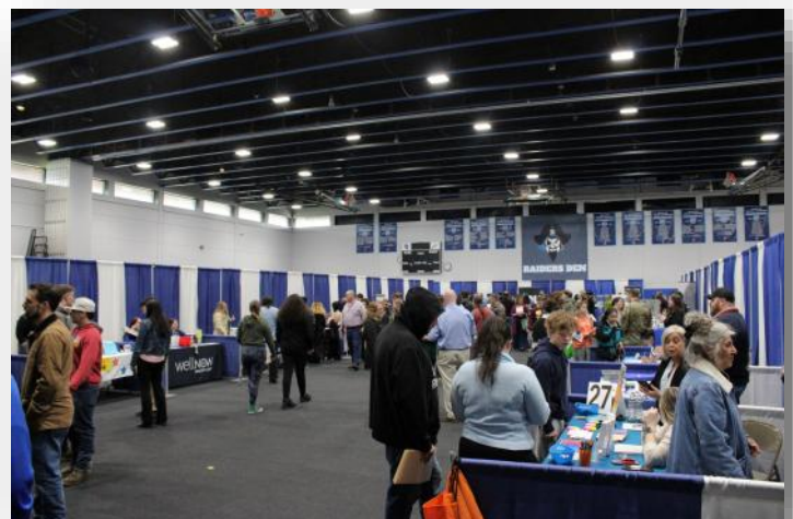
Below: Scene from the Job Fair where nearly 500 job seekers came to talk to 75 businesses about available positions.