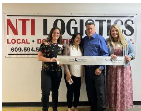
NTI Logistics , 30 Forest Street in Amsterdam, had a ribbon cutting event in April. Specializing in back office logistics, they offer local, domestic, and international shipping.